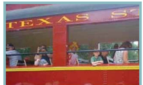
The train pulling into the Palestine RR Park station with it's load of happy children, most had never been on a train